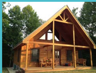
The Cabin on the Hill

We spent a week at a cabin in a remote location near French Lick. While there, Gary's parents, brother Duane, and nephew Luke shared a couple of nights with us. Besides watching an old style baseball game (1864 rules), we also took a train ride and took day trips to several communities in the area including the town of Santa Claus.