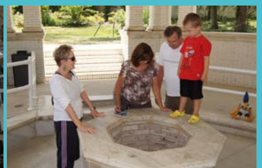
Looking into the wishing well at the French Lick Resort